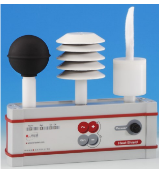
ELR610S: 5 cm diameter black globe sensor satellite modules

The Heat Shield models with radio (ELR610M / ELR615M) can be supplied with additional two wireless satellite modules (ELR610S / ELR615S). The satellite units are used to measure environmental conditions at three positions or levels and calculate Head-Torso-Ankle Weighted Average WBGT. Heat Shield radio can cover up to 300 m in line-of-sight distance, in indoors conditions it may vary.