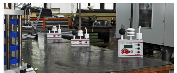
Assesments in three positions of the same environment