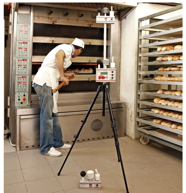
Three levels WBGT on the same vertical