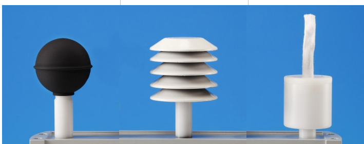
Tg sensor, 5 cm (2") or 15 cm (6") diameter

Heat Shield supports both 15 cm (6") and 5 cm (2") black globes thermometers diameters.