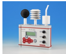
ELR600M / ELR610M: 5 cm diameter black globe sensor

Heat Shield has an algorithm that obtains the temperature of the 5 cm diameter globe (standard according to ISO 7726) starting from the data obtained from the 15 cm diameter globe.