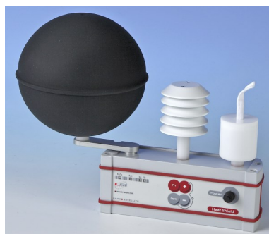
ELR615S: 15 cm diameter black globe sensor satellite modules